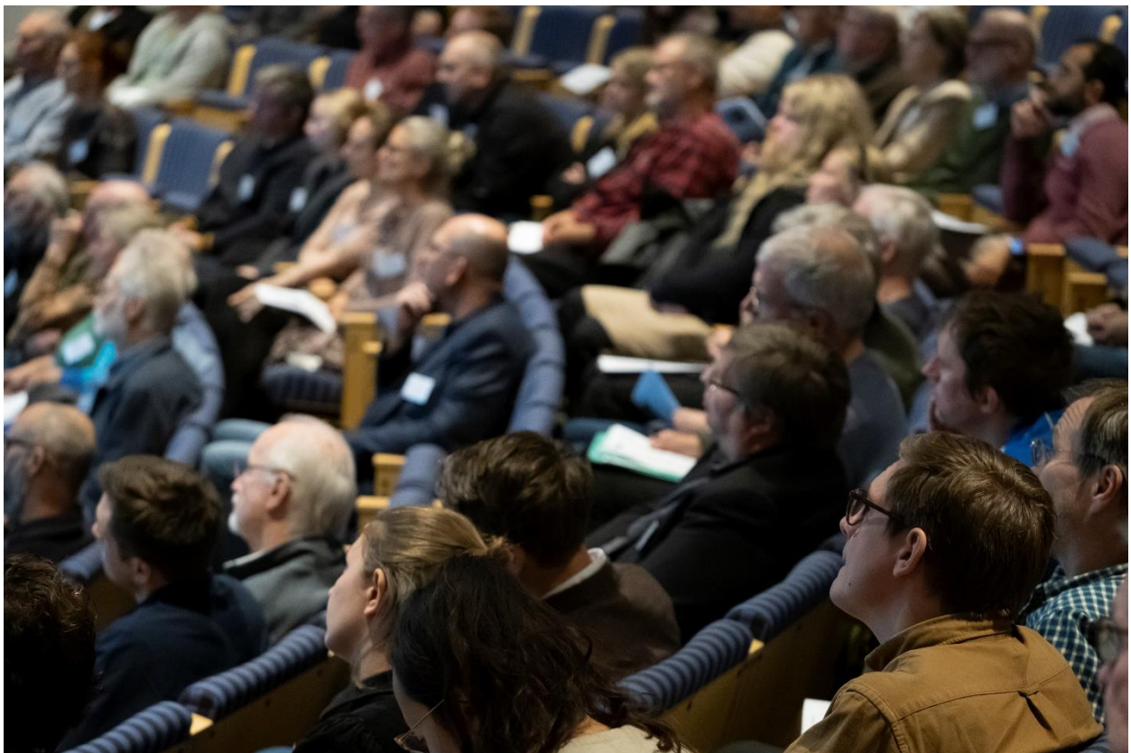
The 180 participants listened to seven invited experts, who gave lectures on different aspects of how one can track fish. Videos of the lectures are available at FishBase Sweden's YouTube channel.