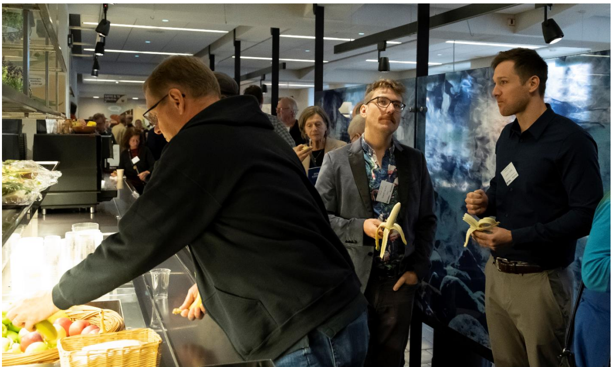
Fruit break mingle