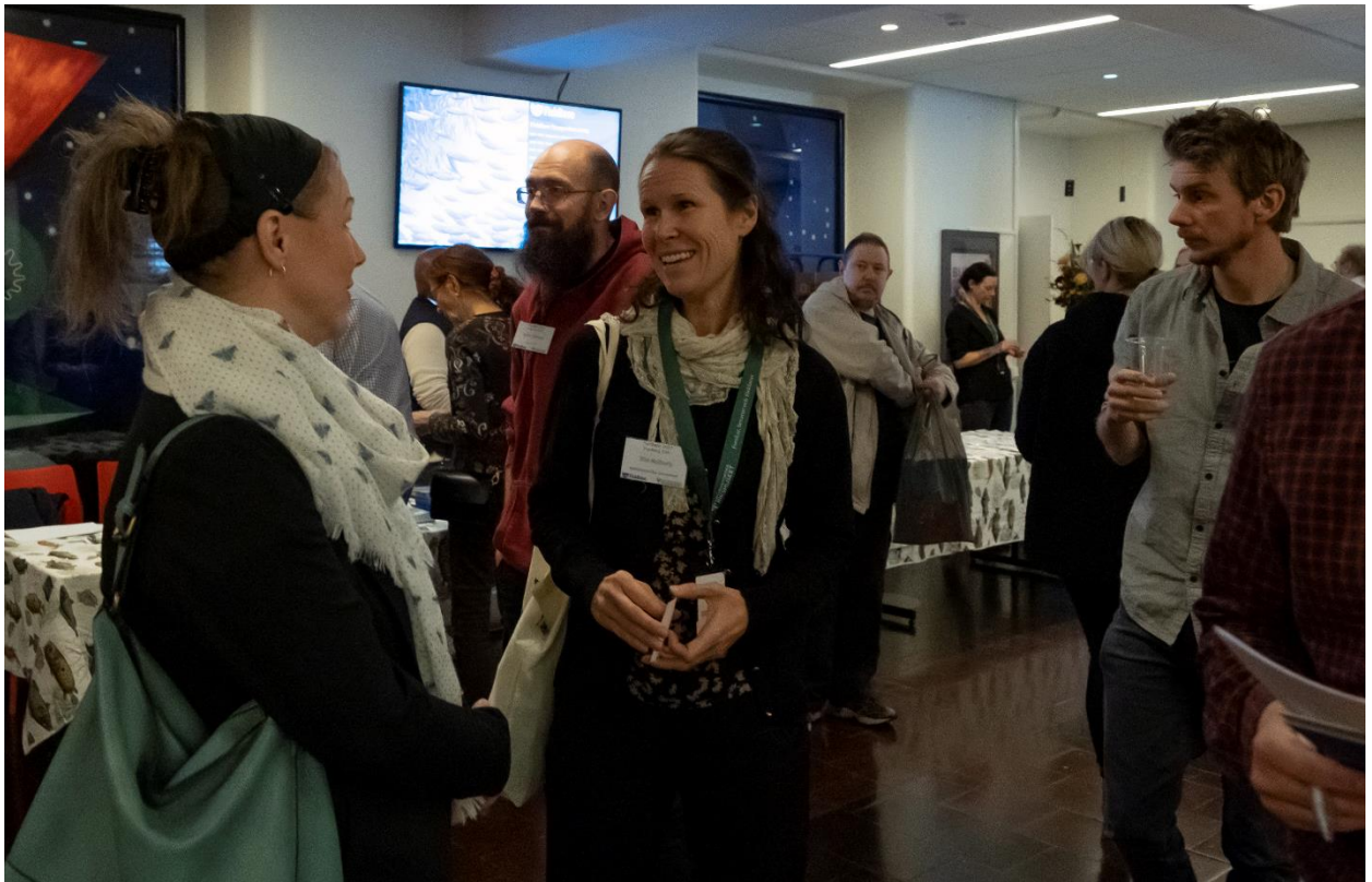
Participants registering for the Symposium