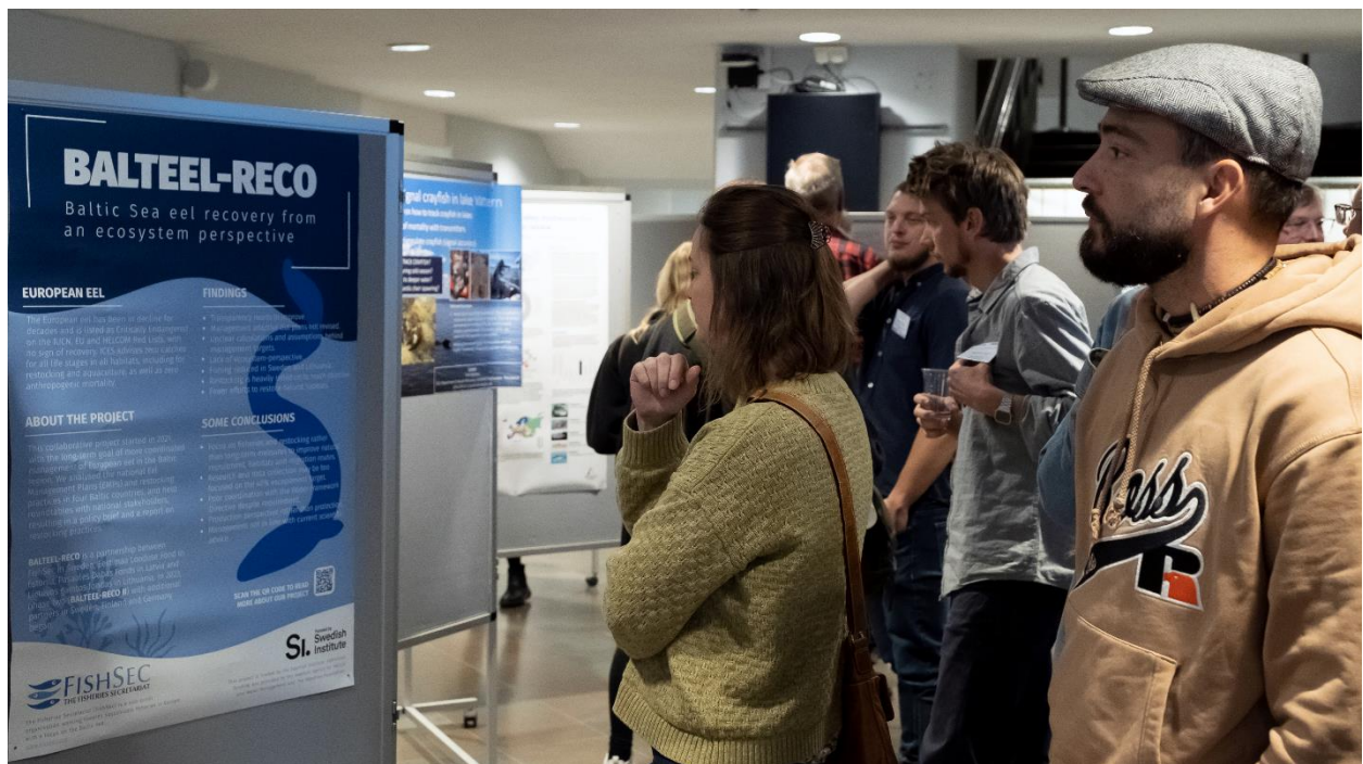
New for this year was that the poster exhibition had its own room