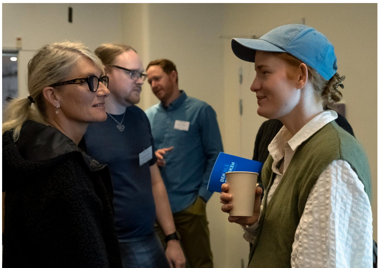
Coffee break mingle